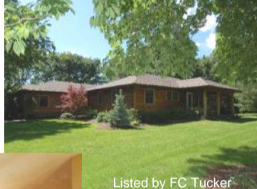
Listed by FC Tucker

544 Amos Dr. Zionsville, IN 5 Bed, 3 Bath $449,900