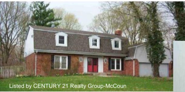
Listed by CENTURY 21 Realty Group-McCoun

1419 Douglas Dr Carmel, IN 5 Bed, 3.5 Baths $164,900