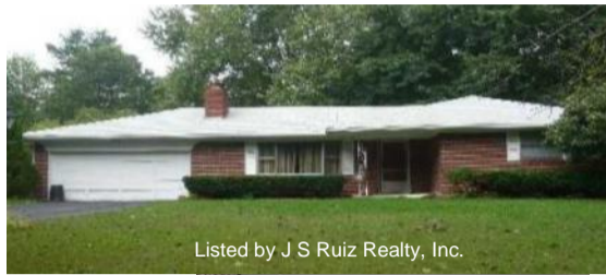
Listed by J S Ruiz Realty, Inc.

BRICK RANCH HOME ON ALMOST A HALF ACRE. 3 BEDROOMS, 1.5 BATHS, PLUS A SEPERATE DINING ROOM, GAS LOG FIRE-PLACE LOCATED IN THE LIVING ROOM. NICE LOT, BIG BACK YARD WITH MATURE TREES. ALL BEDROOMS WITH HARDWOOD FLOORS. SLIDING GLASS DOORS IN DINING ROOM, LEADING OUT TO SCREENED IN PORCH. PLEASE SEE AGENT REMARKS. 1272 ft. sq.