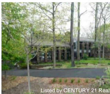
Listed by CENTURY 21 Realty Group