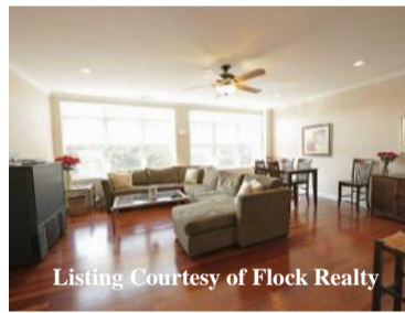
Listing Courtesy of Flock Realty