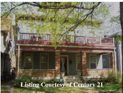
Listing Courtesy of Century 21