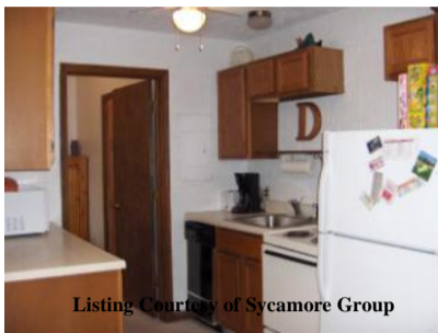
Listing Courtesy of Sycamore Group

Wonderful use of space in this cozy New York style flat. Situated in the heart of the Historic Old North side neighborhood on this beautiful tree-lined street. Mass Ave, Downtown & the Monon Trail are all a short walk from your front door. This unit boasts high ceilings, leaded windows, new appliances, laundry on site & storage in the basement. Newer heat pump & air conditioner. Private parking behind the building.