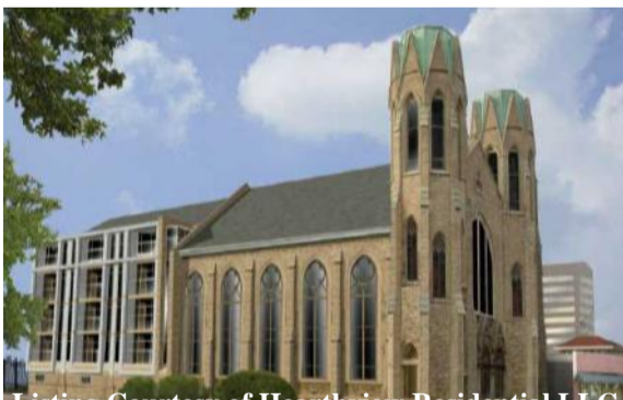
Listing Courtesy of Hearthview Residential LLC